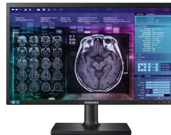
TC241W - 24" TC Series Thin Client Display (LF24TOWHBFM/ZA)