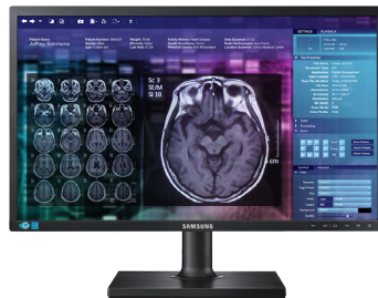
NC241-TS — 23.6" NC Series Zero Client Display (LF24NEHBNU/GO)