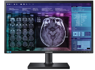
S24E650DW — 24" SE650 Series LED Monitor (LS24E65UDWG/ZA)